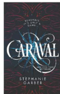
Caraval Stephanie Garber